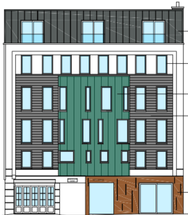
PROPOSED NORTH ELEVATION 1:100